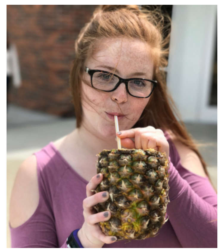
Students pedaled a bike-powered blender to make healthy green smoothies. created with the bike blender.