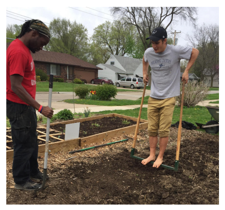
Students planted carrots, beets, and other spring crops at several garden workdays.